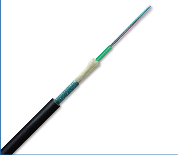
Part Number: 008TEY-13138A2G