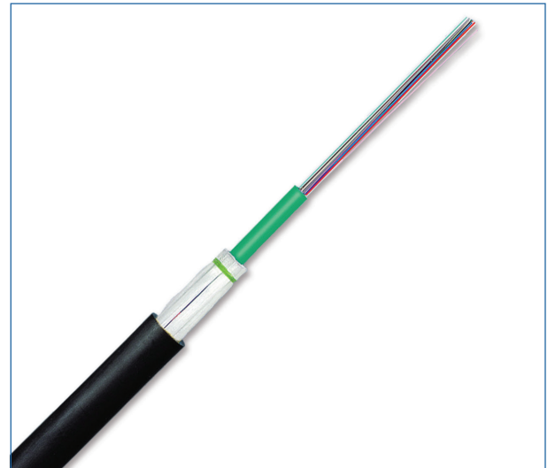
Part Number: 012TEU-13198A2G