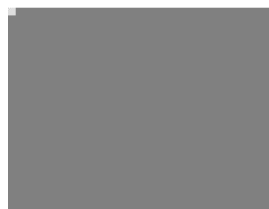
ALE-400 DeskPhone SIP mode with Azur customisation kit 3ML27140AC