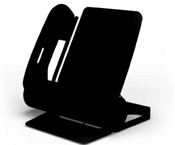
ALE-500 DeskPhone (SIP mode) with ALE-100 keyboard

and conference phone capabilities, thus minimizing the number of devices in the enterprise space.