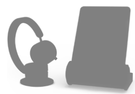
ALE-500 DeskPhone SIP mode without handset Neptune Blue and AH80 BT headset