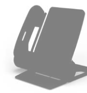
ALE-500 DeskPhone NOE mode and Ruby red customisation kit 3ML27140AD