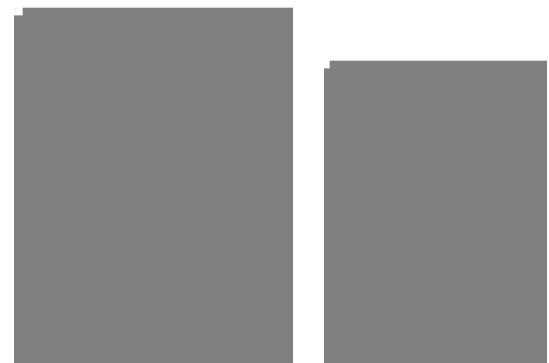
EM200 Smart Expansion Module

The EM200 is specifically designed for receptionist, secretarial and other customer profiles who require multiple concurrent telephone services. Hard keys allow users to set functions, such as speed dial, that improve productivity.