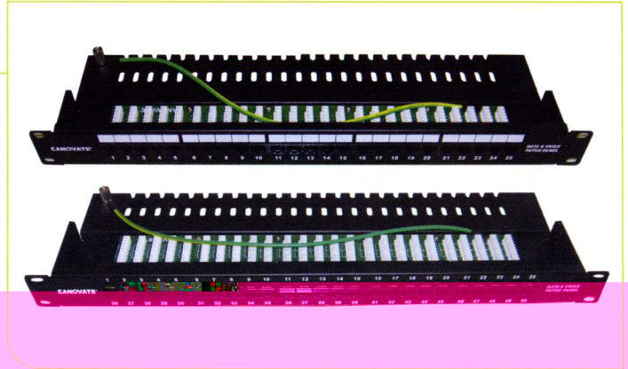
UTP 25/50 Port Horizontal Cat3 Patch Panel