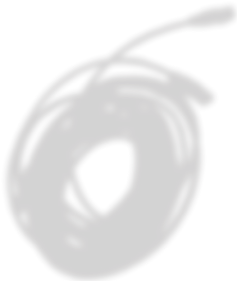
Category 6 RJ45 Patch Cables

Part of 3M™ Volition™ Network Solutions, these Category 6 patch cables allow you to complete your Category 6 system to EIA/TIA 568 or ISO 11801 Class E and EN 50173-1 Class E performance.