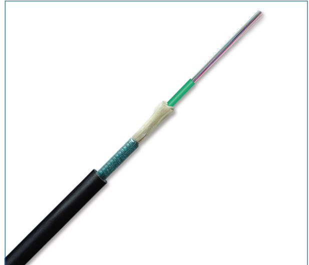
Part Number: 024TEY-13198A2G